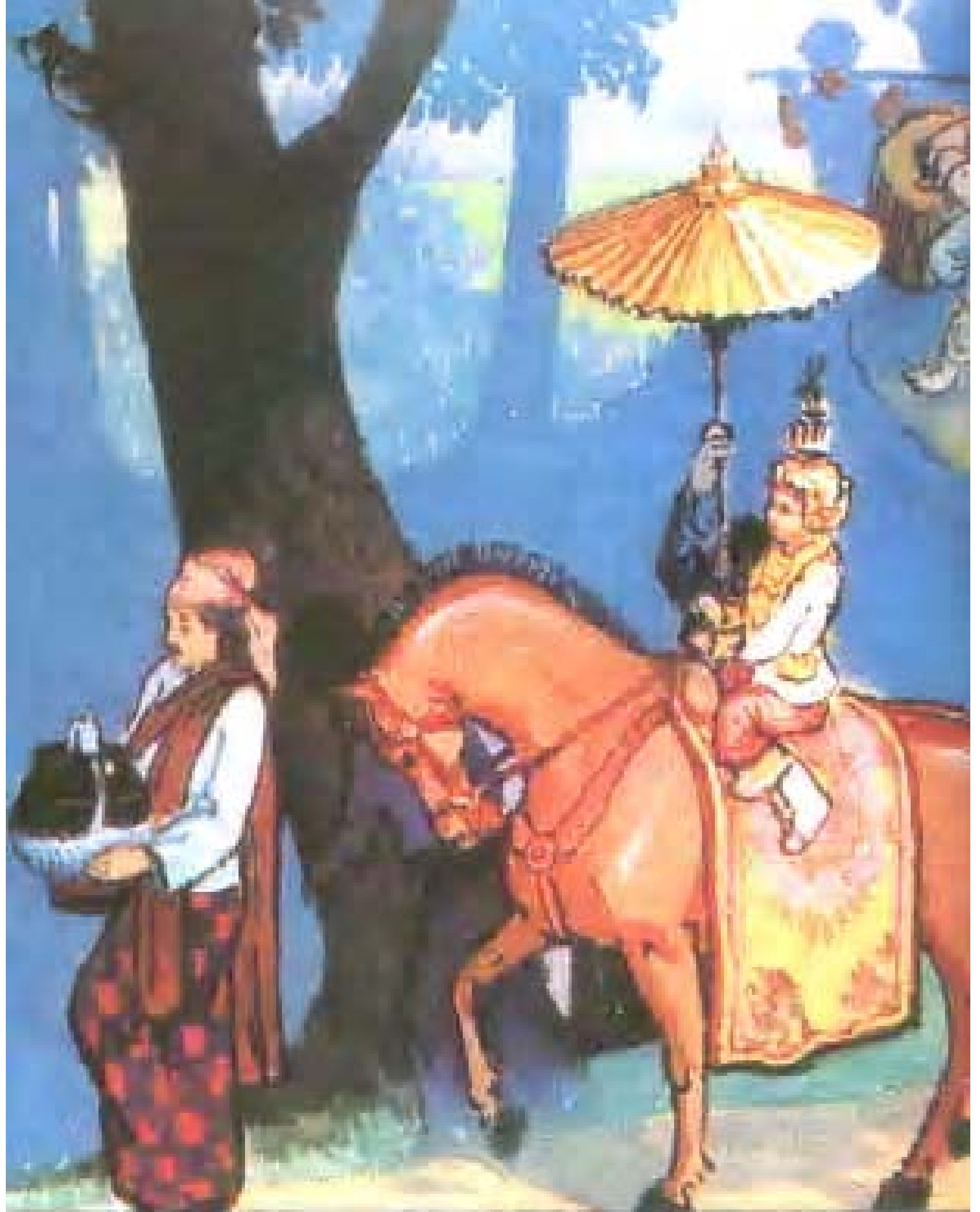
THE SHINLAUNG'S FATHER